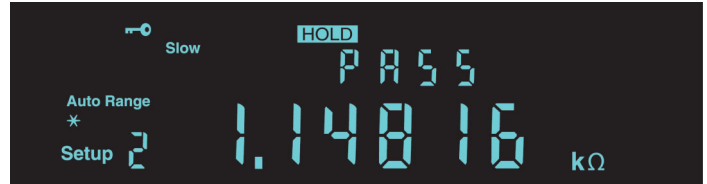
Limit compare mode on the DMM4020.

Dedicated front-panel buttons provide fast access to frequently used functions and parameters, reducing setup time. You no longer need to search through software menus to find the function you need.