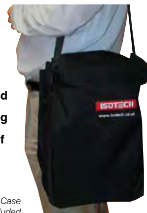
Carrying Case included