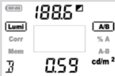
Luminance ratio measurement A/B