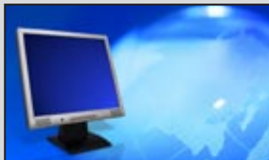
Measuring the reflections at monitors