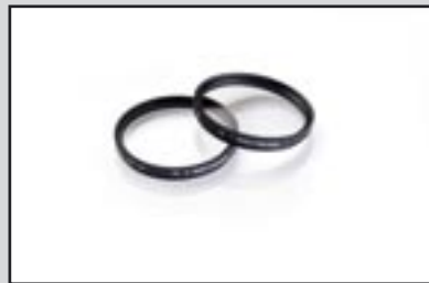
Close-up lenses 1 and 2