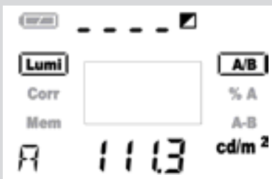
Read-out in the display of luminance measurement

A data memory for storing up to 1000 single measuring values, which can be subdivided into 10 groups, is available in the MAVO-SPOT 2 USB. The memory data can be visualized and processed directly with the keyboard and the display or also in the PC via USB Port and the included standard software.