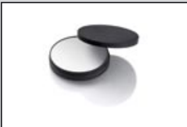
GOSSEN Reflexion Standard