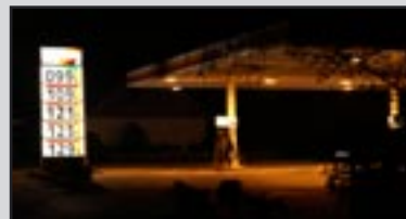
Measuring light immissions