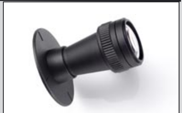
Measuring probe for contact measurements