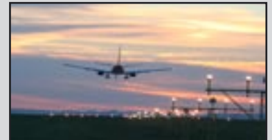
Measuring airfield guidance lights