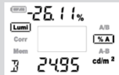
Luminance ratio measurement percentage % A