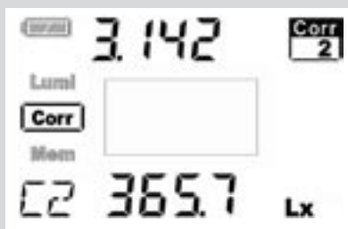
Lux measurement with Reflexion Standard