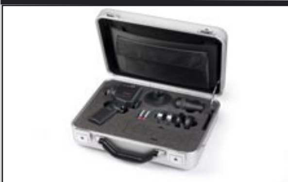
The MAVO-SPOT 2 USB is supplied in a practical, strong aluminum transport case