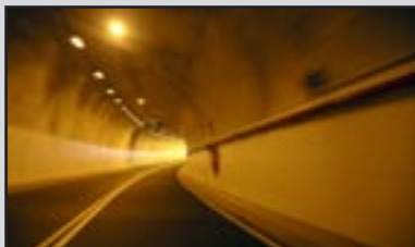
Lighting of tunnels