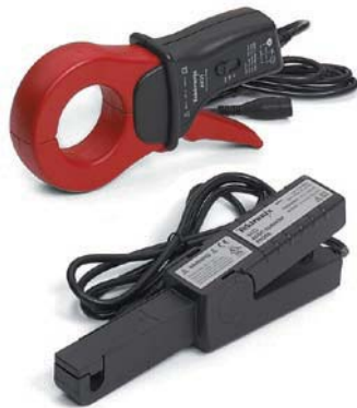
Illustration shows high performance current probes from Tektronix Inc.

Normally the probe provides a method of mechanically splitting the magnetic circuit to enable the conductor to be inserted. The position of the conductor within the loop has relatively little effect upon the measurement.