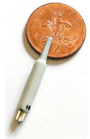
The illustration shows the main part of the magnetometer. The field sensing element is of sub-millimetre dimensions and is placed at the tip of the sensor.

This enables it to use an excitation frequency of several tens of MHz resulting in a sensor with a bandwidth of dc to 5MHz combined with low noise and wide dynamic range.