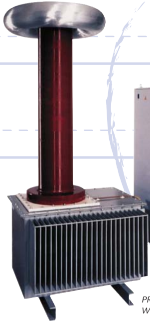
PROGRAMMABLE VERSION WITH EXTERNAL TRANSFORMER