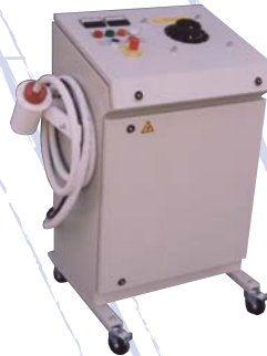
MANUAL VERSION WITH INTEGRATED TRANSFORMER