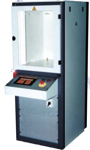
PROGRAMMABLE VERSION WITH INTEGRATED TRANSFORMER AND SAFETY CAGE

“ Each model is built according to voltage and current customer requirement in order to keep our low cost policy ”