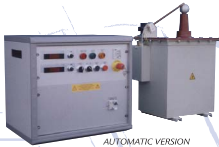
AUTOMATIC VERSION WITH EXTERNAL TRANSFORMER