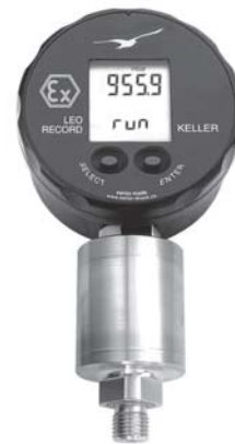
LEO Record Capó Ei