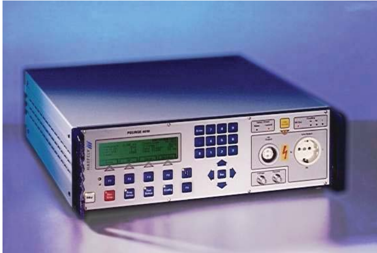
PSURGE 4010 - the compact IEC combination wave generator

Surge voltage transients are caused by switching and lightning effects. The PSURGE 4010 allows evaluation of the performance of equipment when subject to high-energy disturbances on power and interconnection lines.